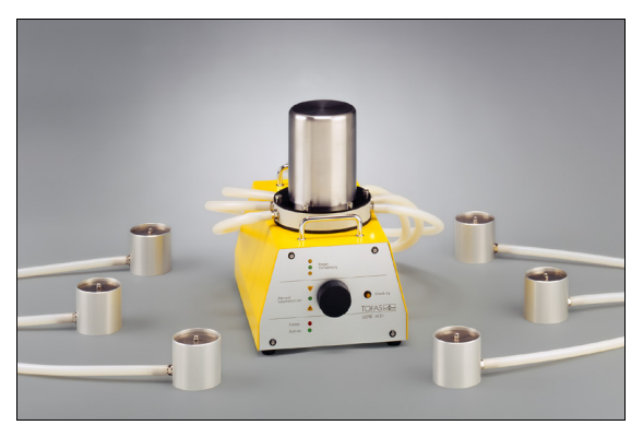
Aerosol Distribution and Dilution System ADD 536

Hospital operating rooms are specially designed to avoid contaminations and therefore additional infections of patients during operations. To assure a low level of particle contaminations a laminar air flow is applied to the operating table. To verify the retention efficiency of this flow regime a verification with a defined test aerosol is required according to the standards DIN 1946-4 and SWKI 99-3. For that reason a total particle rate of 6.3·10<sup>9</sup> P/min has to be distributed to six different positions and emitted with a reliable long term stability. From the standards it is also required that this total particle rate is continuously monitored and controlled by a particle counter. The Topas Aerosol Distribution and Dilution system ADD 536 meets all these required demands for providing a defined test aerosol with the following features: