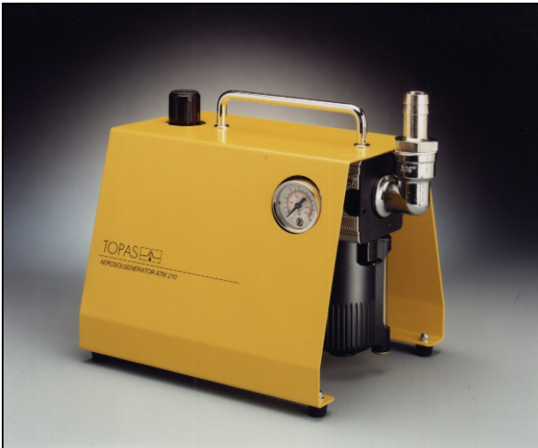
Atomizer Aerosol Generator ATM 210