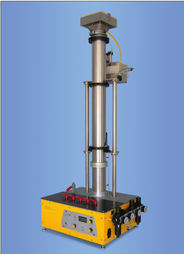
Manual Filter Media Test Rig MBP 116

Performance of filter media is essentially defined by parameters such as differential pressure, gravimetric filtration efficiency and dust holding capacity. The Topas Manual Filter Media Test Rig MBP 116 can be applied to determine these filter parameters at flat sheet materials. This test rig has been designed as universal testing equipment. It combines a simple and robust setup with a manual and therefore cost efficient handling and operation. The following test rig components are assuring a reliable and timesaving test procedure: